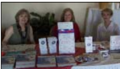
Voter Service Table

Asian Pacific Islanders Forum- October 9