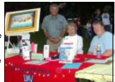
Voter Service Table

We encourage members to participate in this new Speakers Bureau format and invite you to please call the League office at 447-8683 and leave a voicemail message with the best time to reach you.